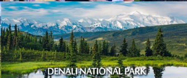
DENALI NATIONAL PARK